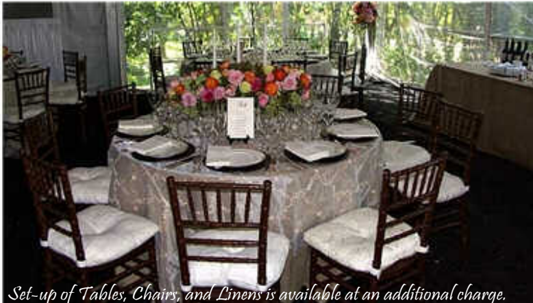
Set-up of Tables, Chairs, and Linens is available at an additional charge.

For specialty linens or non-stock colors, please contact one of our helpful sales representatives at 214-774-0912.